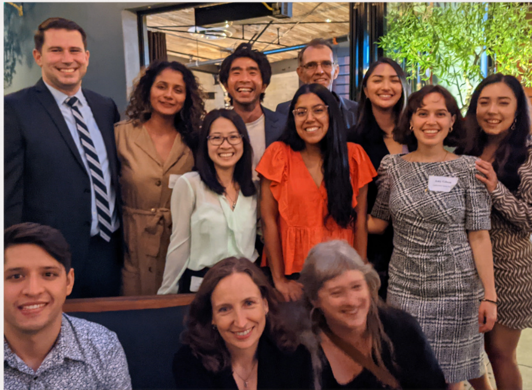
CAW's "Extended Family" 2021

Conserving Resources. Preventing Pollution. Protecting the Environment.